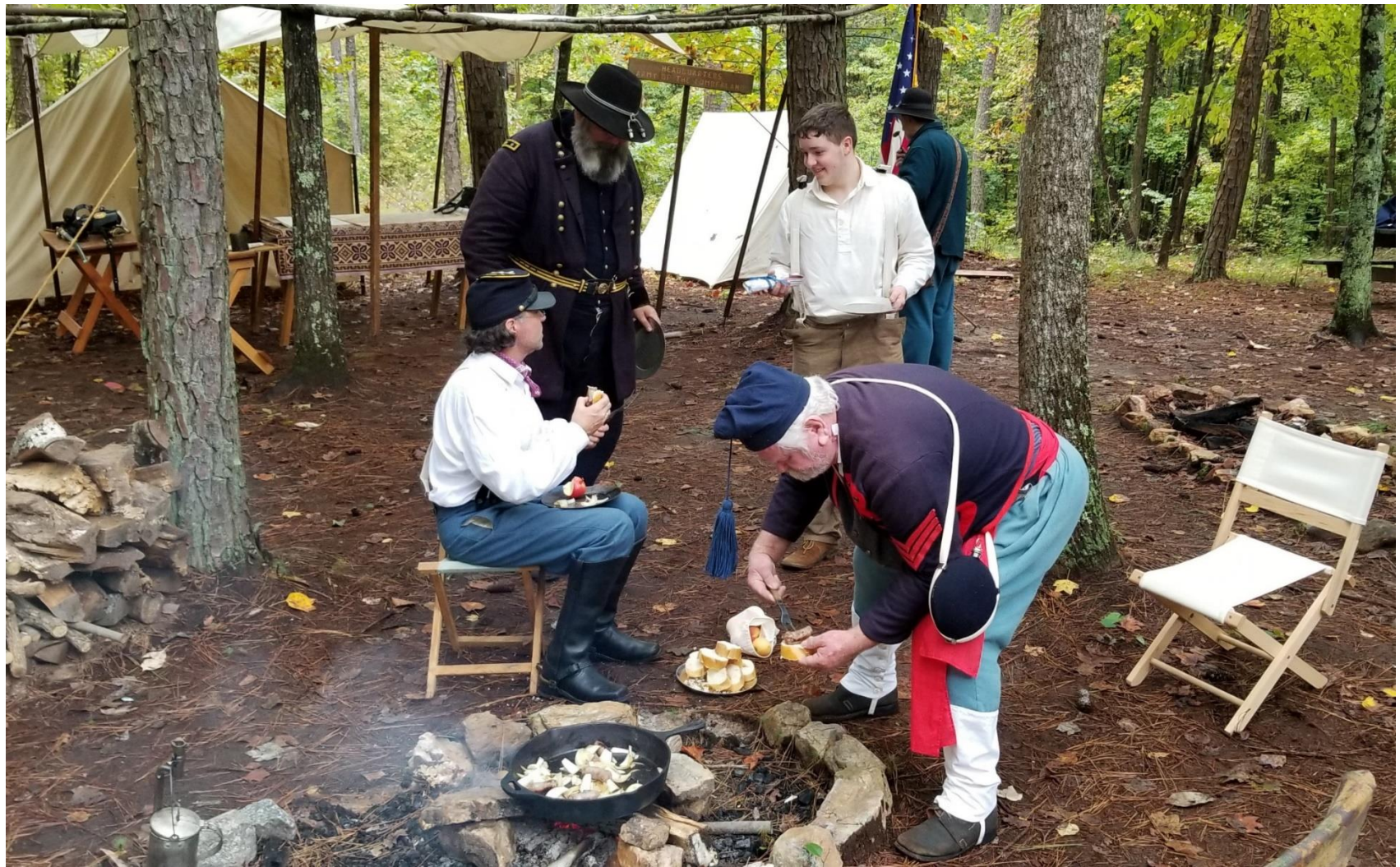
Cooking lunch the old-fashioned way!