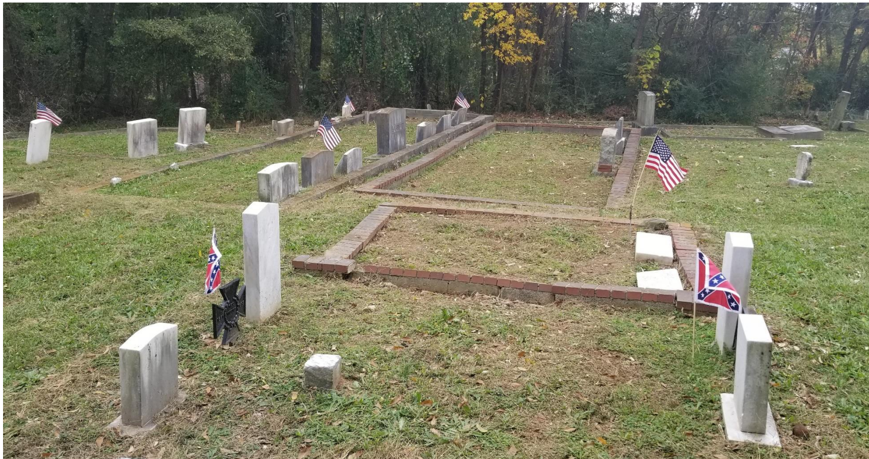
Above: Veterans graves decorated with flags