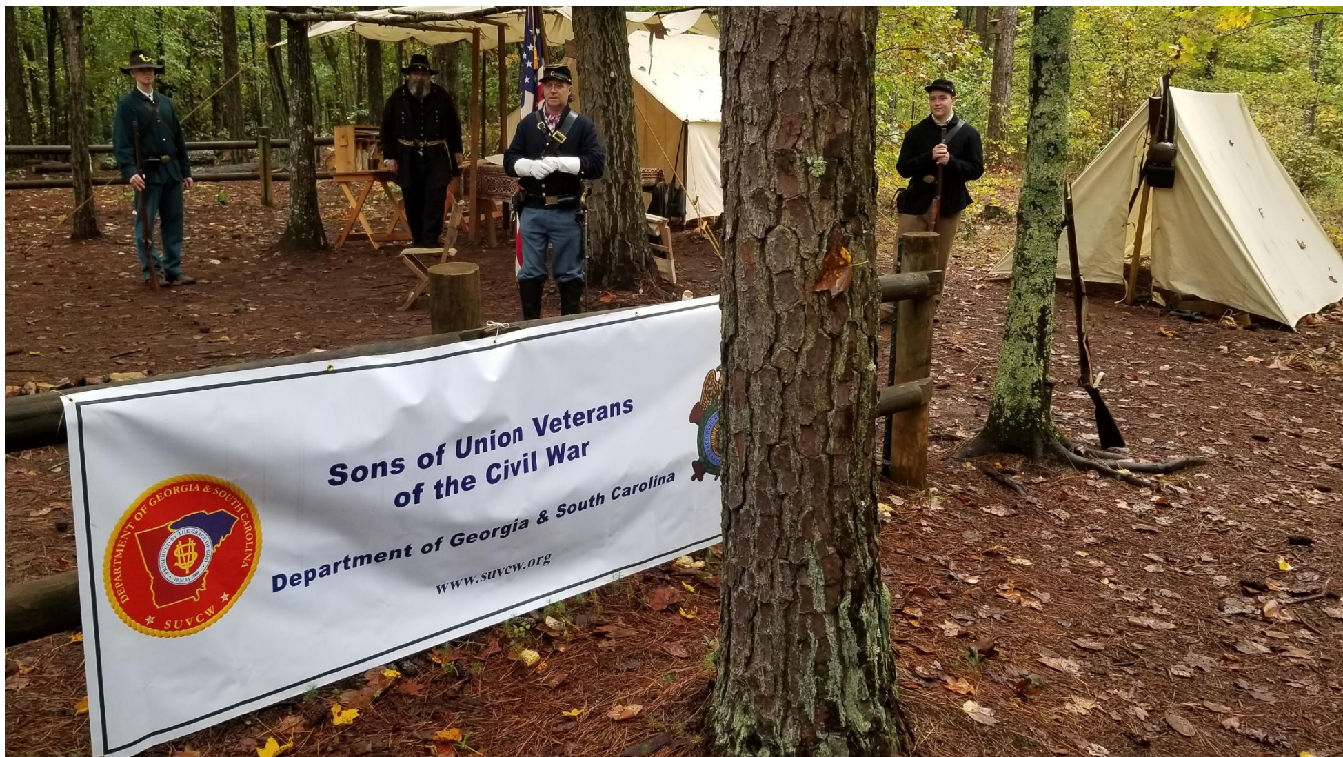
Above: View of our Union Officers Camp